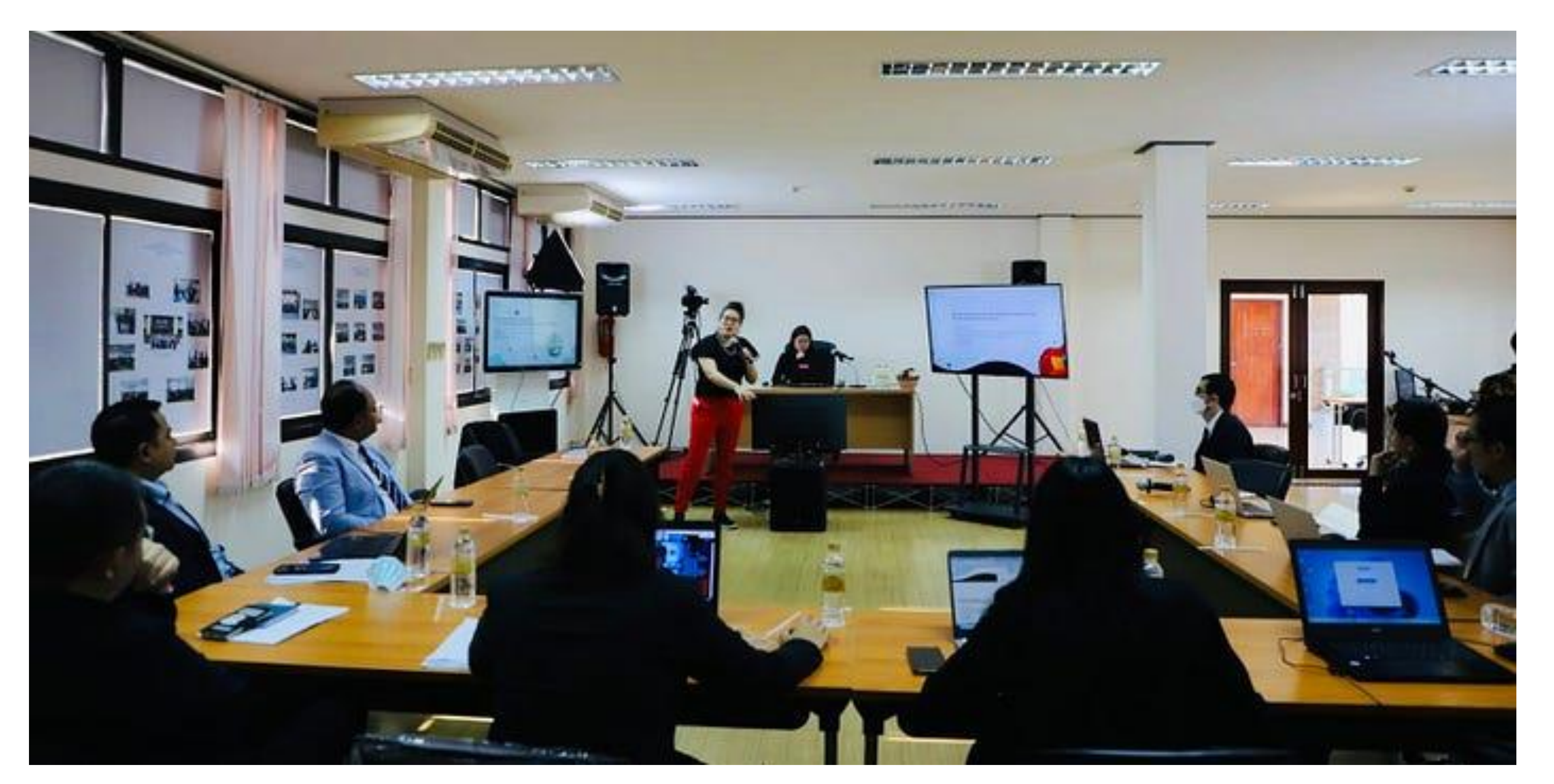
Our research discussion

methodologies and practices are updated regularly. 9. Specialized Units Enhance Focus: Establishing specialized departments or teams within SAIs that focus exclusively on climate finance can lead to more in-depth and focused audits. 10. Global Representation Matters: SAIs should have a voice in global forums like the UNFCCC, where climate finance mechanisms and commitments are discussed.